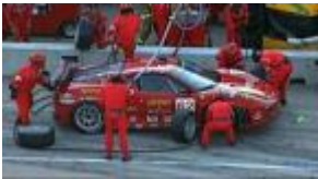
Video: Team Building

Team Turbos are a highly innovative and effective way to accelerate growth and results in your teams. By using this new and revolutionary way of team and leadership development you will significantly increase your return on training investments. Start saving money, time, and effort now. FranklinCovey will provide you with all the necessary tools for your team's success.