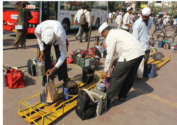
Dabbawalas photograph is courtesy of and copyrighted by Firoze Shakir.

Every core process needs to support the mission in a simple, visible, and consistent